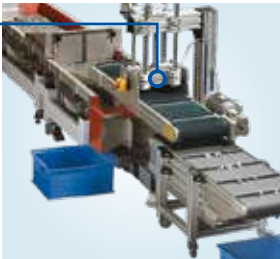
System for storing additional plastic containers for media

Let us prove to you how advanced our technology is We will be pleased to prove the claims we make with regard to our company and the efficiency of the CF series of disc finishing machines. On request, we will provide you with specific and detailed advice on the right finishing system for your application, including formulating the right grinding and polishing media for you. And what's more, we will also finish a sample of your product free of charge and without any obligation whatsoever - and provide a report of all relevant process parameters.