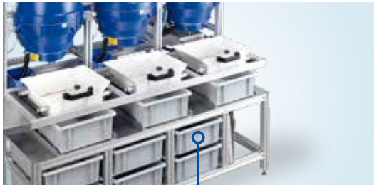
Manual separating unit using manual screen