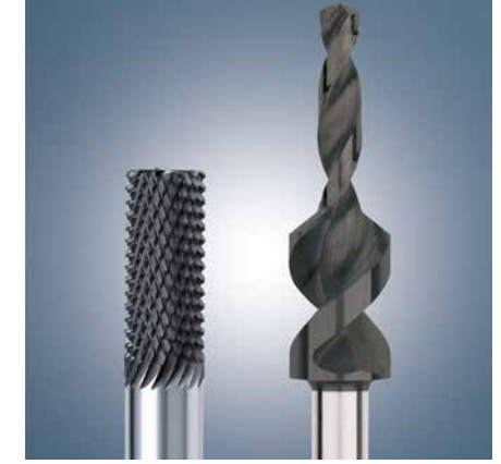
Router with CCDia® MultiSpeed Plus – 17 µm pure Diamond Counter sink drill with CCDia® AeroSpeed®, the benchmark in aircraft production