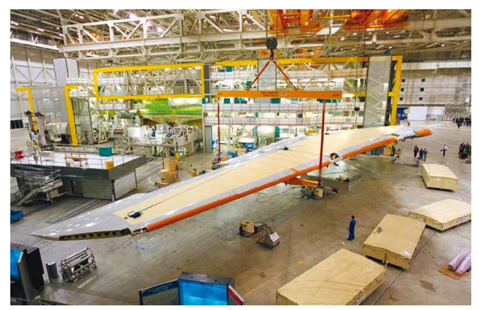
Composite airplane wings, drilling and reaming the rivet holes with diamond-coated tools